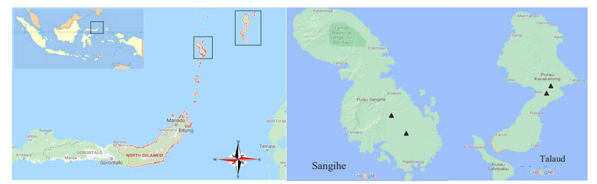
Fig. 1. Map of the study area in Sangihe Islands and Talaud Islands, North Sulawesi, Indonesia (Google Maps, 2021)