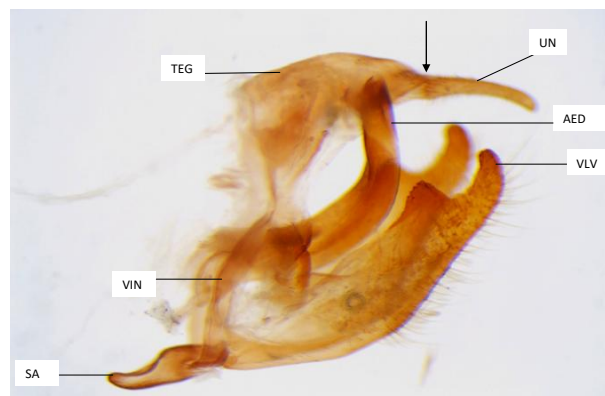
Fig. 2. Male genitalia of Y. parasakra (UN-Uncus; TEG- Tegumen; AED-Aedeagus; VLV- Valva; SA-Saccus; VIN-Vinculum)