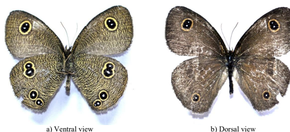
Fig. 1. Male, Ypthima parasakra

was longer and thinner (Eliot, 1987). The 'valva' in Y. parasakra is axe-like at the distal end and hooked at the apex, while in Y. sakra 'valva' is nearly rounded and blunt at apex (Figs. 2, 3). This record from Western Himalaya is significant as it lies 580 km from Mustang,